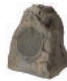
Rock Monitor™ 80-SM